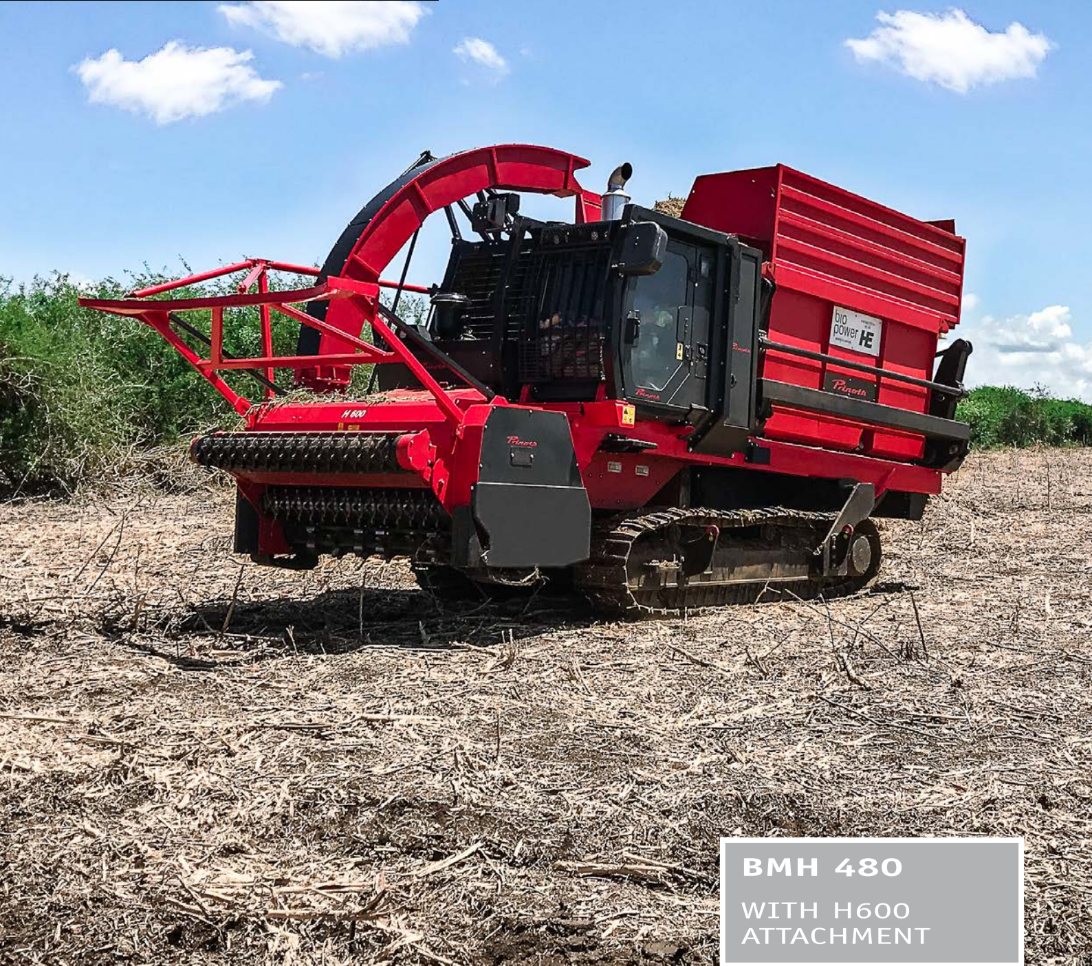
BMH 480 WITH H600 ATTACHMENT